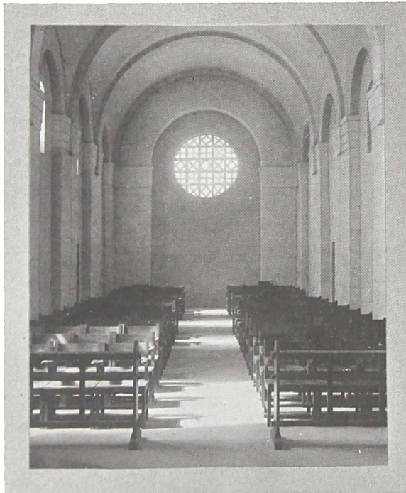
St Andrew's Church, Jerusalem. (Looking westward.)