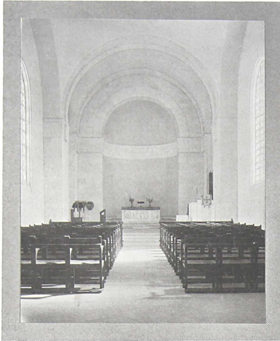
St Andrew's Church, Jerusalem. (Looking eastward.)