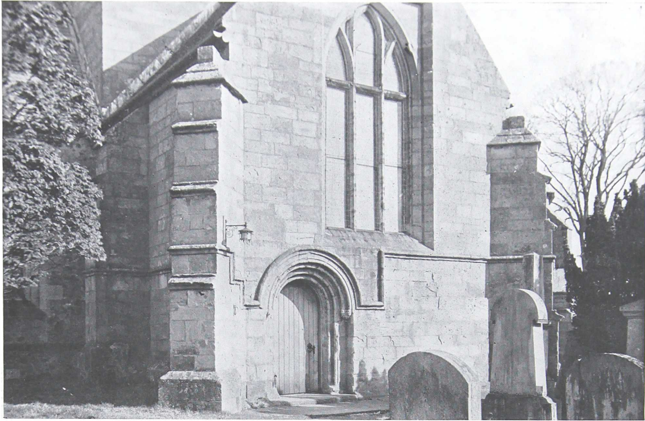
BIGGAR—S. MARY'S: NORMAN DOOR: SOUTH TRANSEPT.